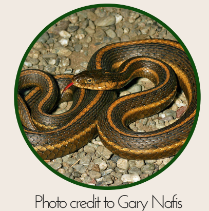
Giant Garter Snake