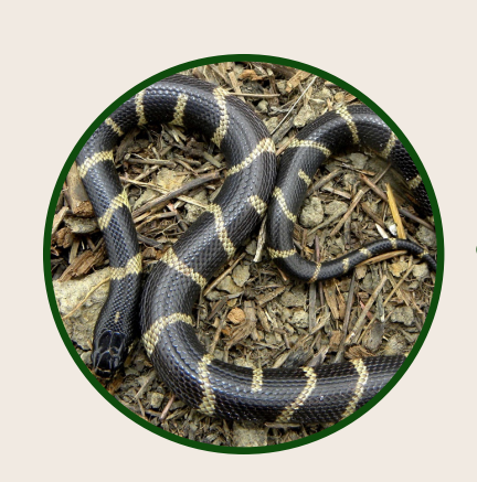
California Kingsnake Lampropeltis californiae

Western Yellow-bellied Racer Coluber constrictor mormon